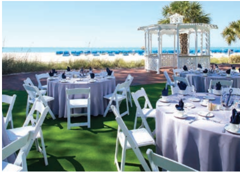
4. SOUTH LAWN 50 – 150 guests for your Ceremony, Cocktail Hour or Reception. Popular for wedding photographs, the white Victorian gazebo adds romantic flair to your event or photographic memories.