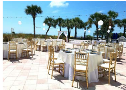
9. NORTH BRECK DECK 100 – 250 guests for your Wedding Ceremony, Cocktail Hour, Reception, Rehearsal Dinner or Brunch. A casual beach terrace with a view of the Gulf of Mexico and spectacular sunsets.