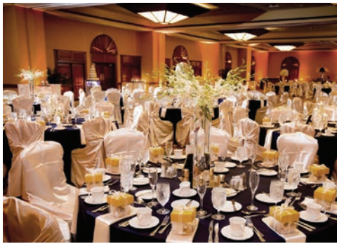
1. ISLAND BALLROOM 150 – 400 guests for large attendance Wedding Receptions, Rehearsal Dinners or Brunches. The ballroom may be used in sections or in its entirety, and the Grand Palm Colonnade may also be utilized for pre-reception cocktails.