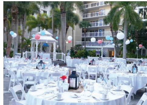
3. GARDEN COURTYARD 75 – 300 guests for your Ceremony, Cocktail Hour, Reception, Rehearsal Dinner or Brunch. This lush area features a gazebo above a bubbling fountain for your ceremony or photographs.