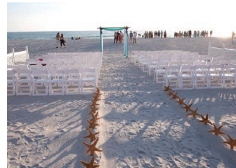
8. NORTH BEACH 50 – 400 guests for your wedding ceremony. This is a beautiful area perfect for any ceremony with sandy toes and salty kisses overlooking the Gulf of Mexico.