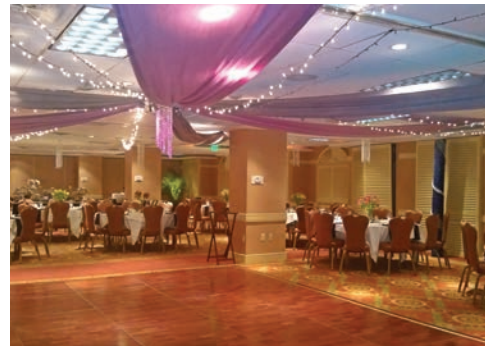
2. JACARANDA HALL 50 – 300 guests for your Wedding Reception, Rehearsal Dinner or Brunch. This hall may be used in sections or in its entirety, and the Jacaranda Foyer can be used for pre-reception cocktails.