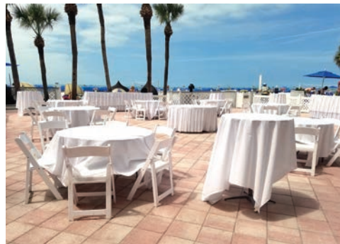
7. SOUTH BRECK DECK 50 – 150 guests for Cocktail Hour, Reception, Rehearsal Dinner or Brunch. This stunning setting offers a scenic view just a few steps away from St. Pete Beach.