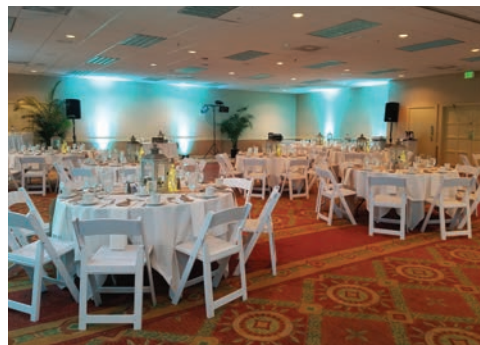
10. HORIZONS BALLROOM 50 – 125 guests for your Reception, Rehearsal Dinner or Brunch. For a more private event, this ballroom affords couples a venue apart from other meetings and functions.