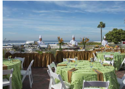
6. SEA BREEZE 50 – 125 guests for your Cocktail Hour, Reception, Rehearsal Dinner or Brunch. This versatile area provides a panoramic view of the beach and Gulf of Mexico.