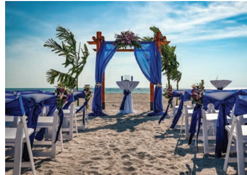
5. SOUTH BEACH 50 – 400 guests for your Wedding Ceremony. This is a versatile area of velvet white beach sand near the gazebo with an expansive view of the beach and Gulf of Mexico.