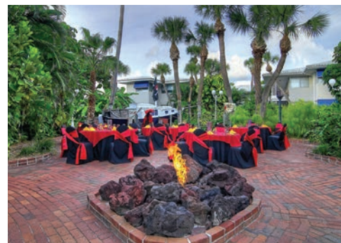
12. PIRATE ISLAND 30 – 60 guests for your rehearsal dinner or brunch. A private Island Oasis surround by lush palm trees and waterways with its very own fire pit and tiki torches.