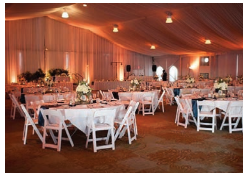
11. THE PAVILION 150 – 600 guests for Reception, Rehearsal Dinner or Brunch. An exceptional venue with softly draped ceilings soaring to 23 feet and plenty of space for buffet lines, band and dance floor.